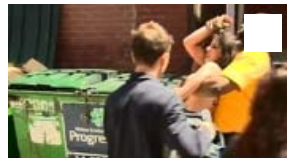
Raw: Topless protester grabbed (Warning nudity)