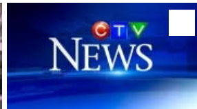
CTV News at Six Montreal for Thursday, June 4, 2015