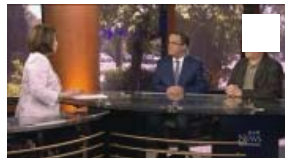
CTV Montreal: Analysis: Parizeau, Peladeau, and PQ